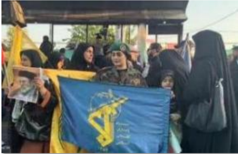
Iranian girls carrying the flag in the “Epic of the Street”