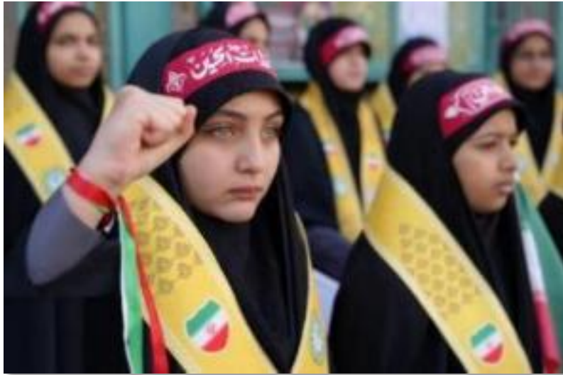
Six children martyrs from one family in Charbagh, Karaj, in the U.S.–Israeli bombing